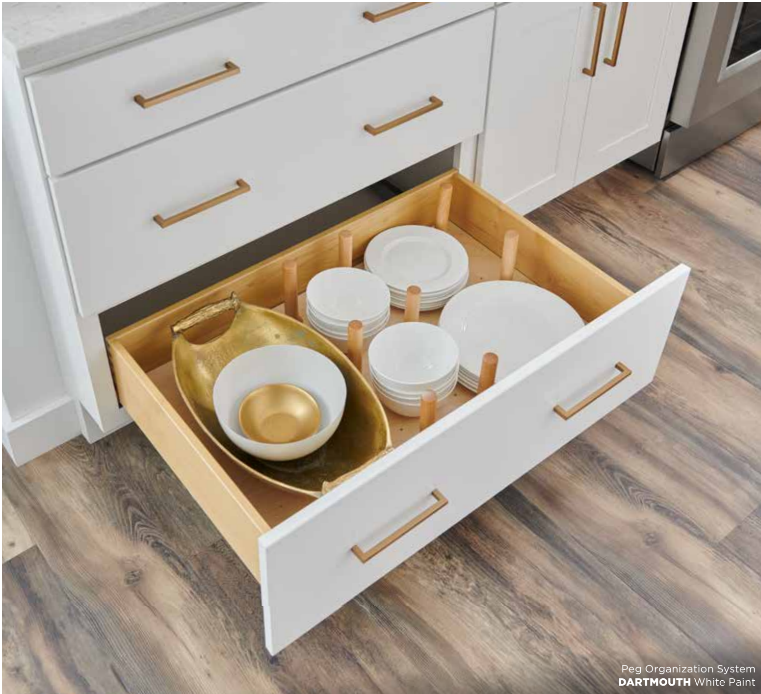
Peg Organization System DARTMOUTH White Paint