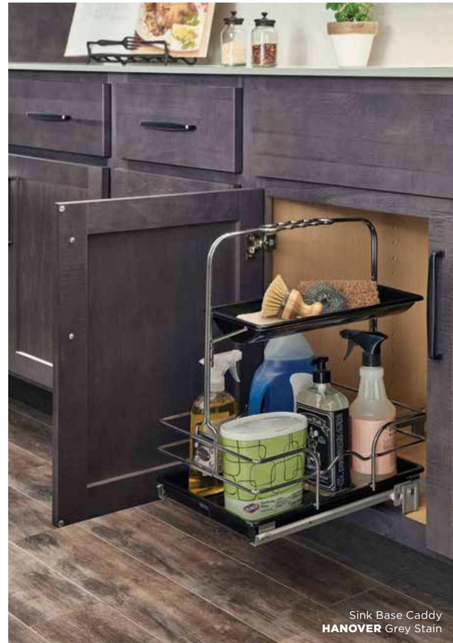
Sink Base Caddy HANOVER Grey Stain