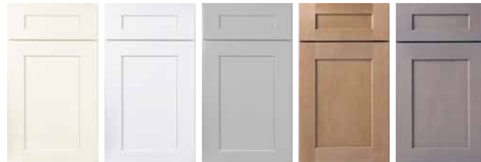
Opal Paint White Paint Pewter Paint Sandalwood Stain Terrain Stain

Classic style and practical storage make your dream a reality. Enjoy affordable, high-quality Wolf Classic cabinets with the additional peace of mind of our new Limited Lifetime Warranty .