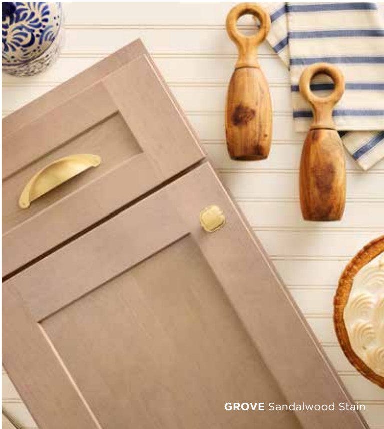
GROVE Sandalwood Stain