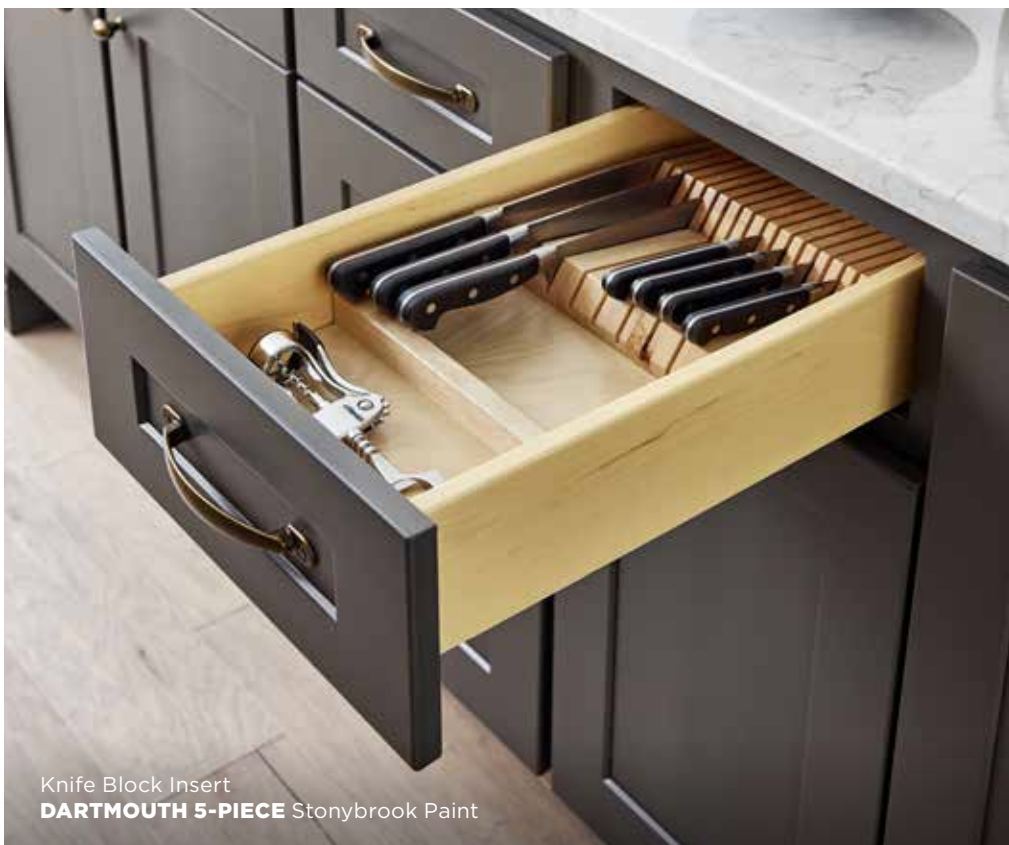
Knife Block Insert DARTMOUTH 5-PIECE Stonybrook Paint