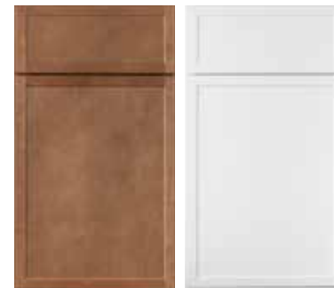
Hazelnut Stain White Paint