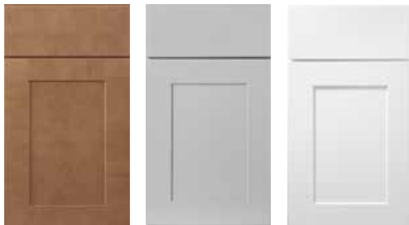
Hazelnut Stain Pewter Paint White Paint