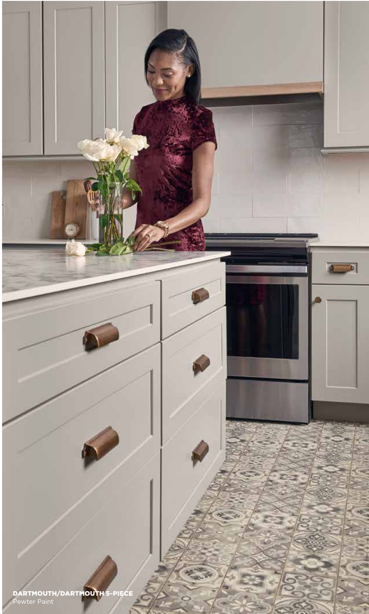
DARTMOUTH/DARTMOUTH 5-PIECE Pewter Paint