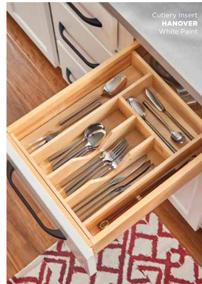
Cutlery Insert HANOVER White Paint

When designing Wolf Classic cabinets, we had both form and function in mind. From food storage to recycling, these simple solutions will make your space work hard for you.