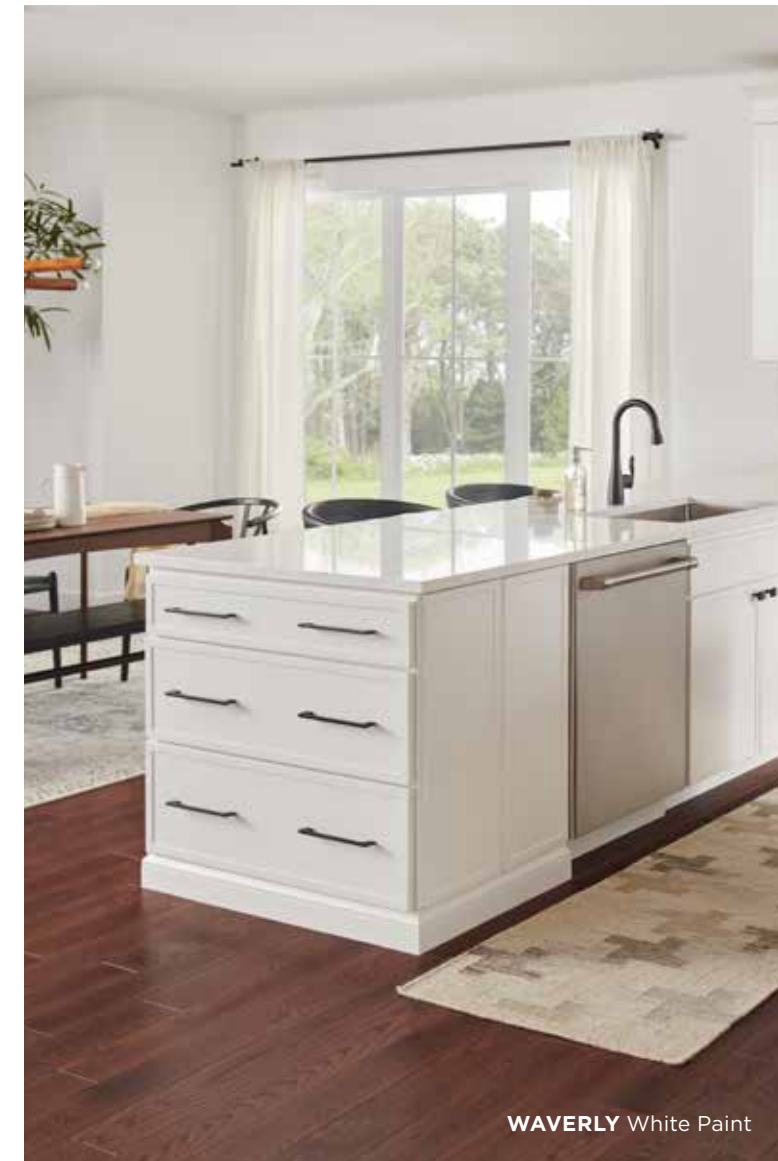
WAVERLY White Paint