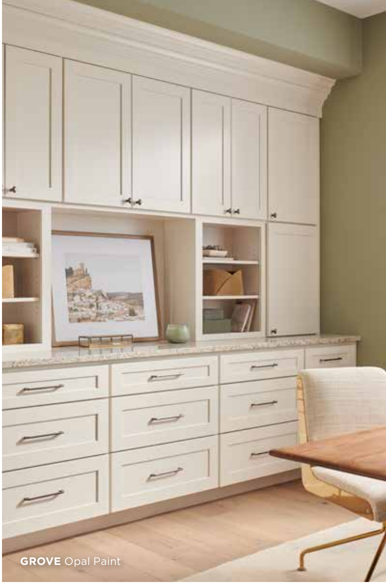
GROVE Opal Paint