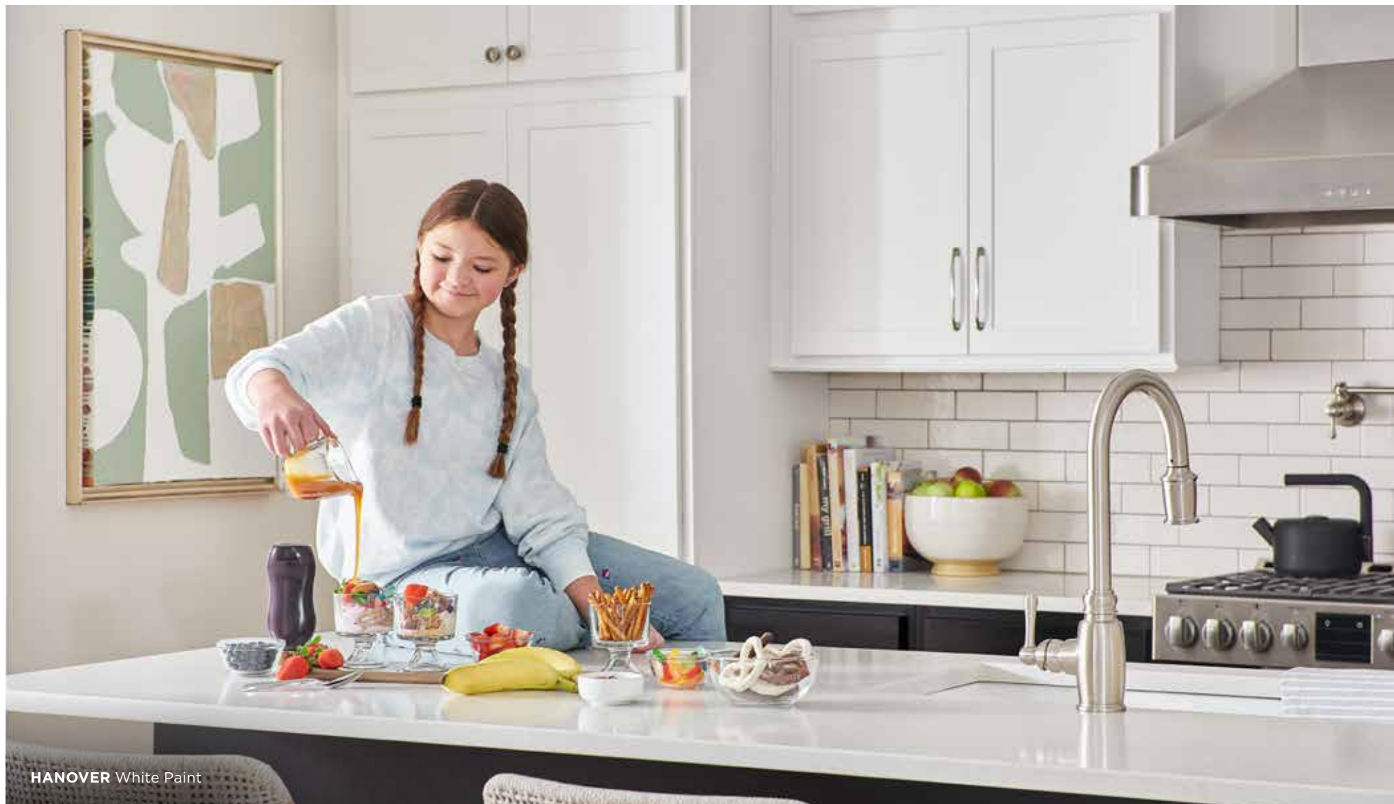
HANOVER White Paint