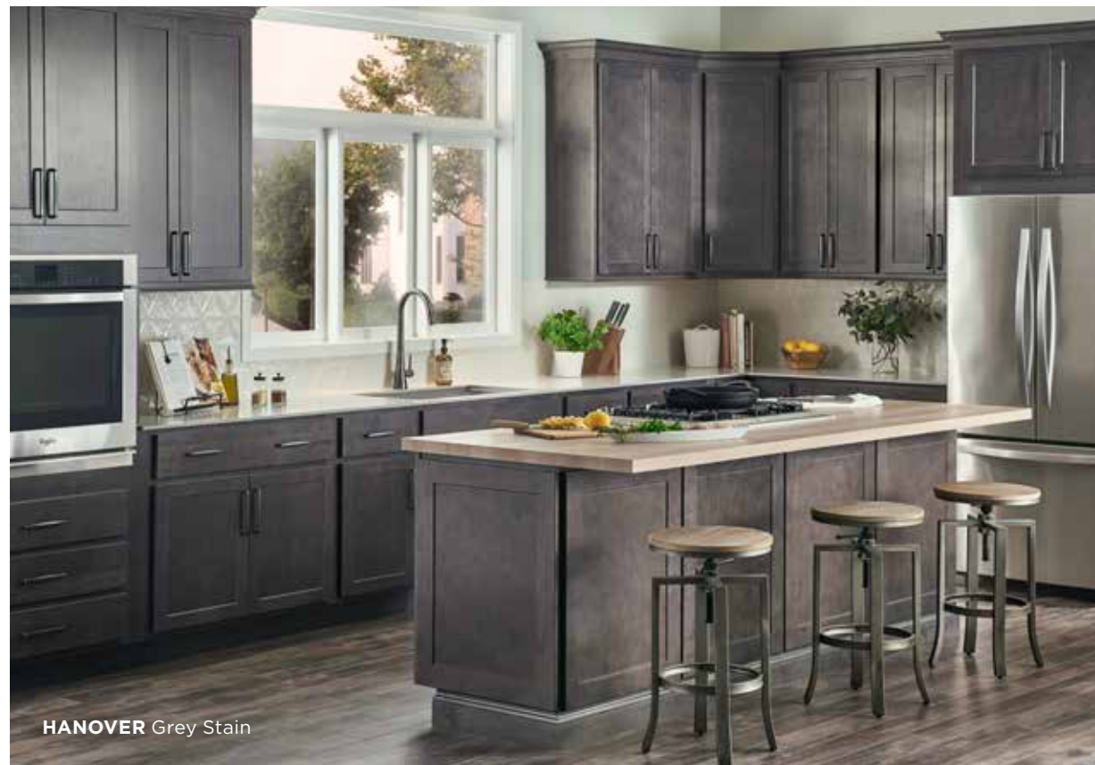
HANOVER Grey Stain