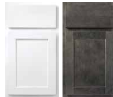
White Paint Grey Stain