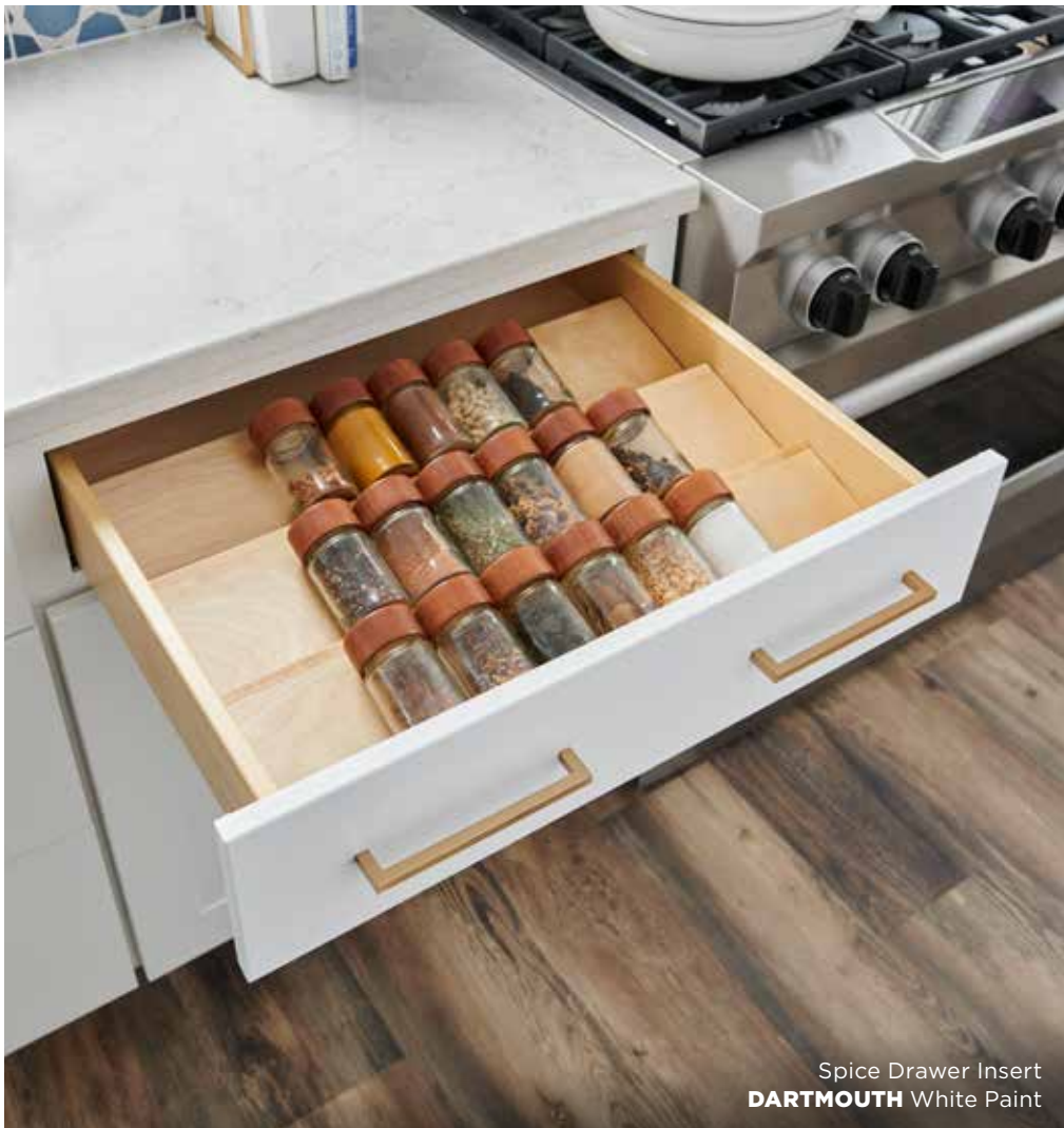
Spice Drawer Insert DARTMOUTH White Paint