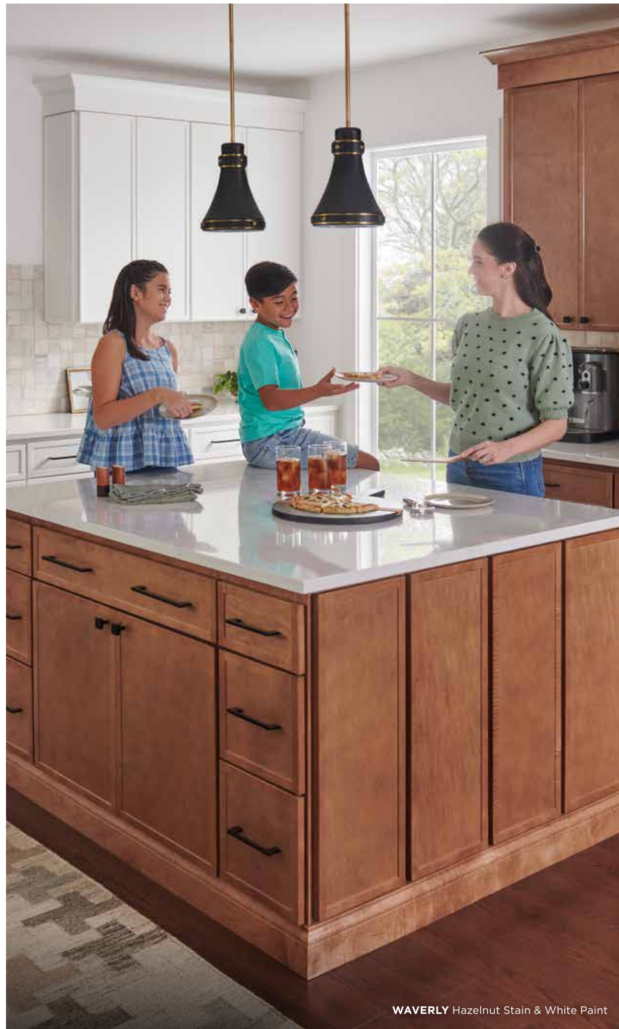
WAVERLY Hazelnut Stain & White Paint