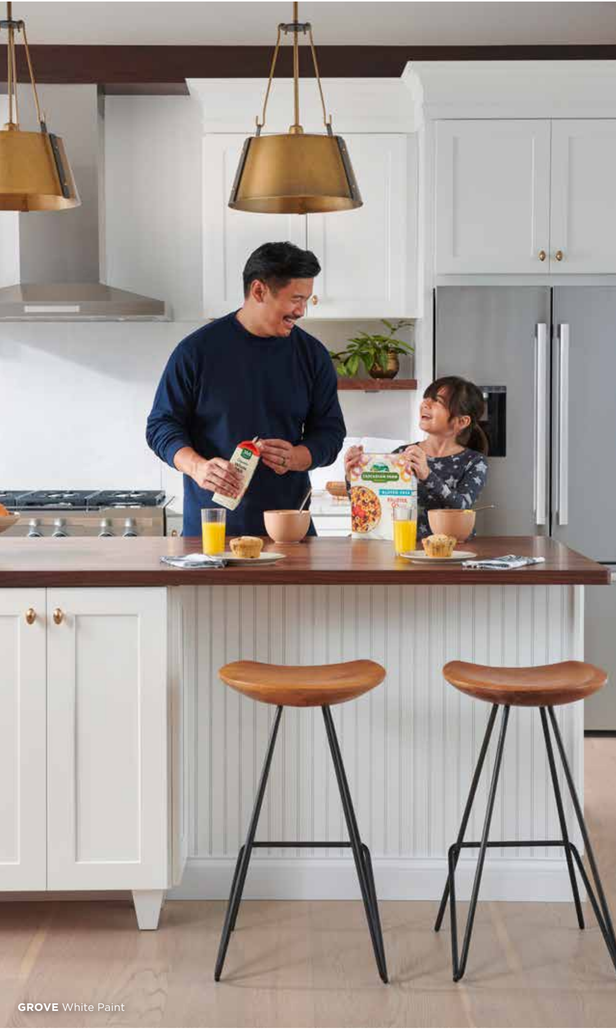
GROVE White Paint