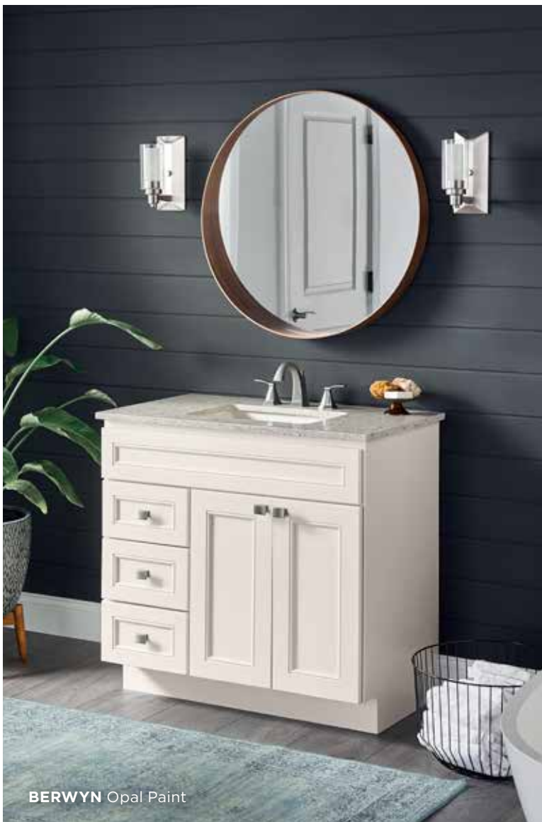
BERWYN Opal Paint