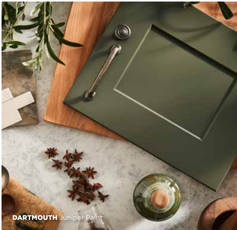
DARTMOUTH Juniper Paint