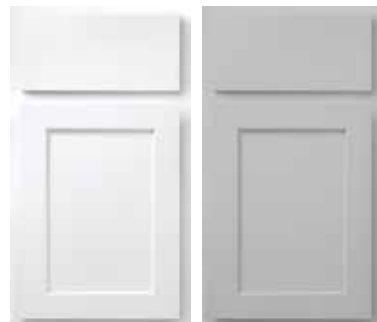
White Paint Pewter Paint