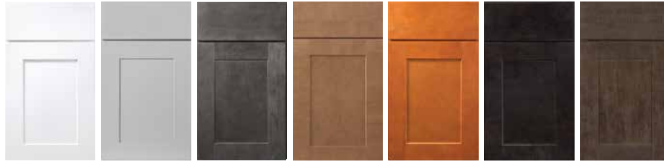
White Paint Pewter Paint Grey Stain Hazelnut Stain Honey Stain Dark Sable Stain Brownstone Stain