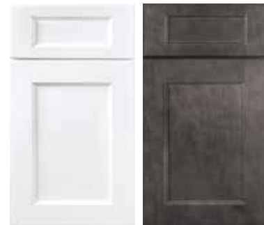
White Paint Grey Stain