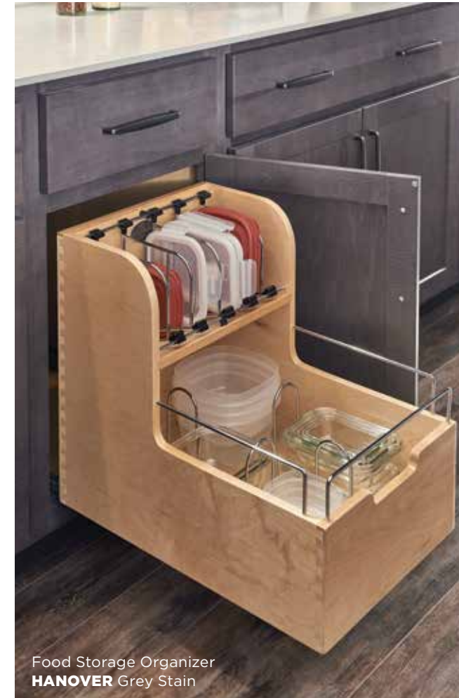
Food Storage Organizer HANOVER Grey Stain