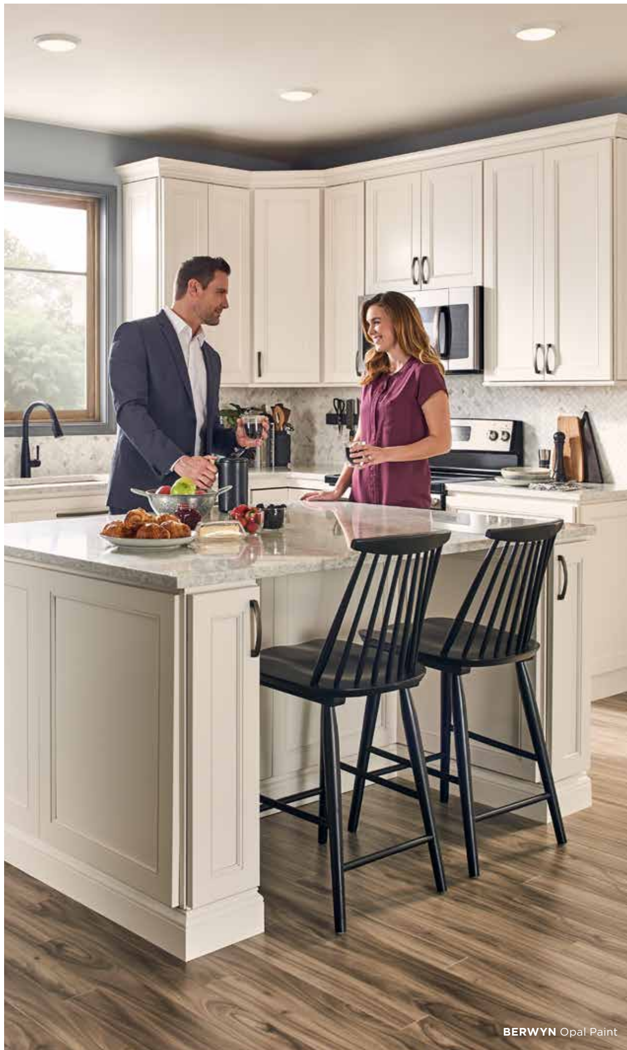
BERWYN Opal Paint