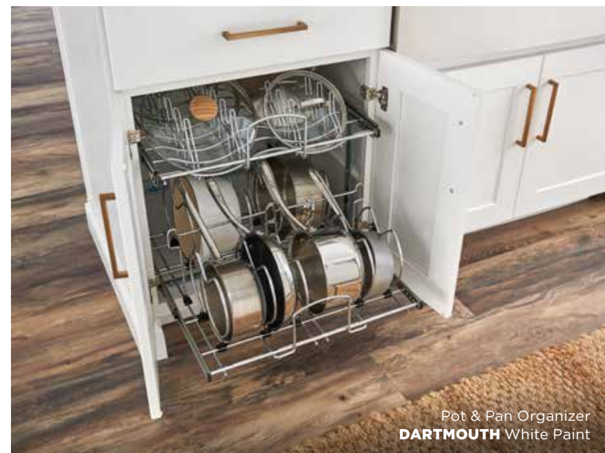
Pot & Pan Organizer DARTMOUTH White Paint