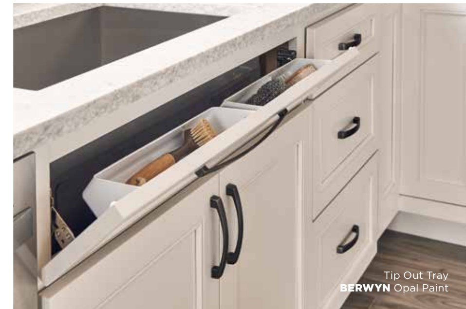
Tip Out Tray BERWYN Opal Paint