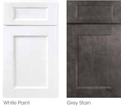
White Paint Grey Stain

With clean lines and a classic look, York cabinets are a homeowner's dream. Available in a paint and stain finish, York cabinets make the perfect match for any design. Versatile, yes, but with enough detail to elevate the style of your space.