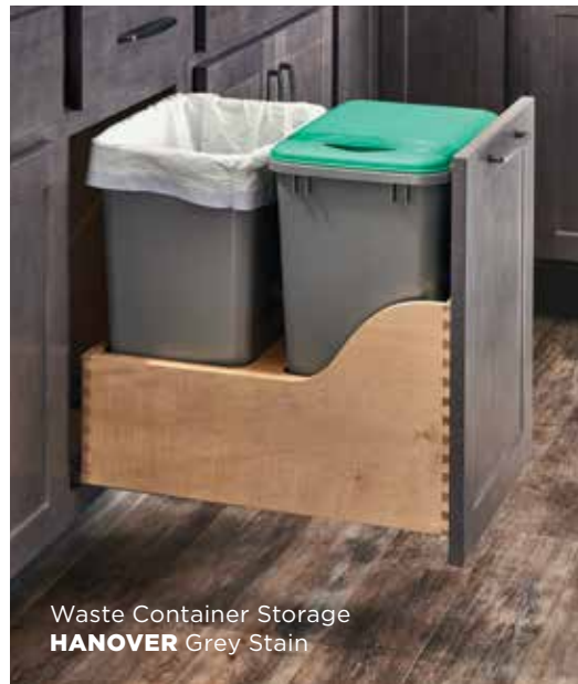
Waste Container Storage HANOVER Grey Stain