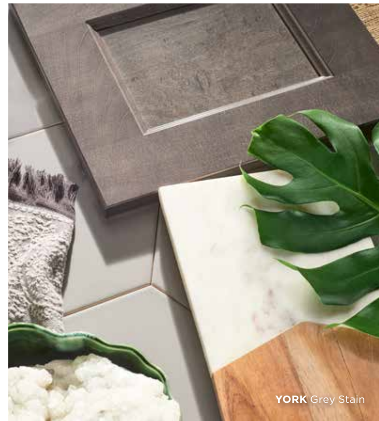
YORK Grey Stain