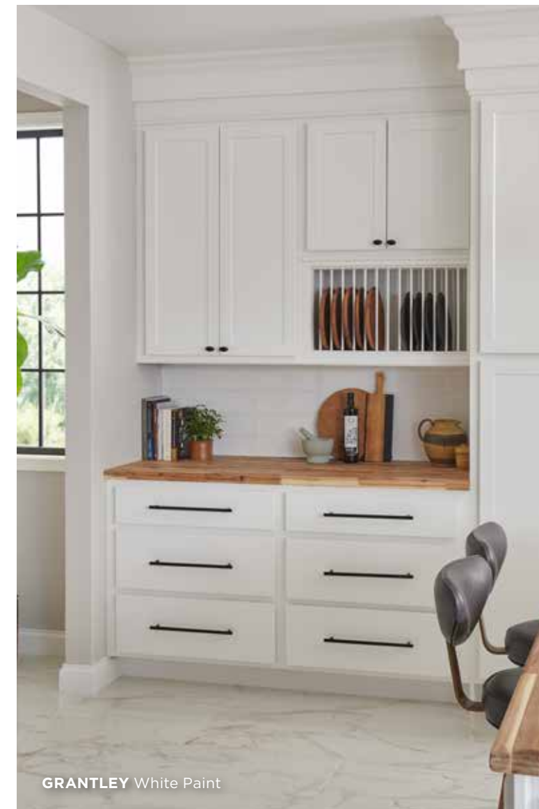
GRANTLEY White Paint