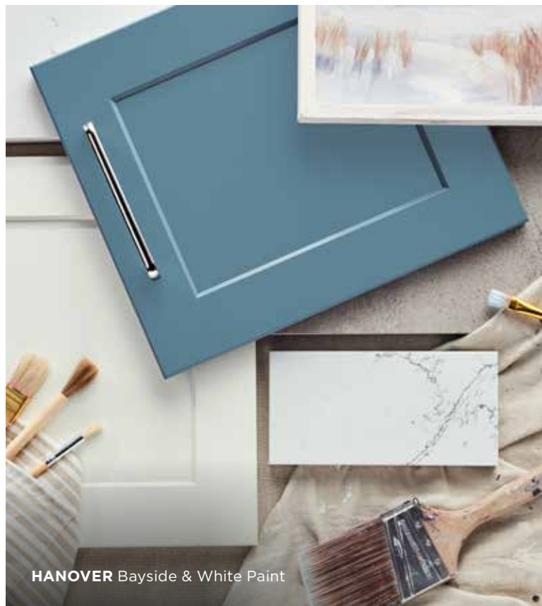
HANOVER Bayside & White Paint