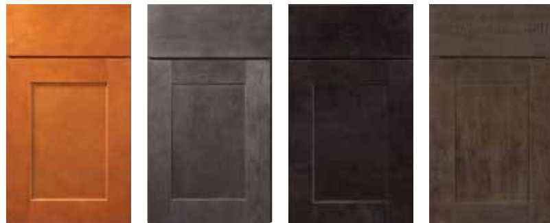
Honey Stain Grey Stain Dark Sable Stain Brownstone Stain

A blank slate can be a wonderful thing. With our Dartmouth cabinets, you can give any space a clean, contemporary look. Modern Shaker-style doors make the perfect canvas for your hardware and accessory choices. Available in five different stains and two popular paints, Dartmouth cabinets are as adaptable as they are good-looking.