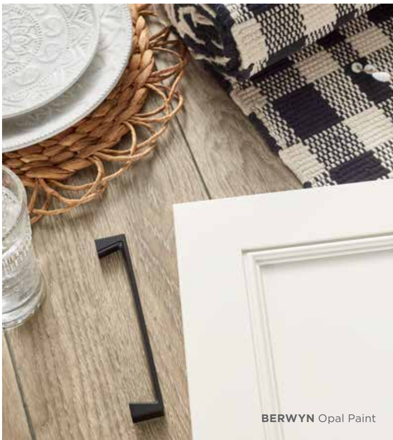
BERWYN Opal Paint