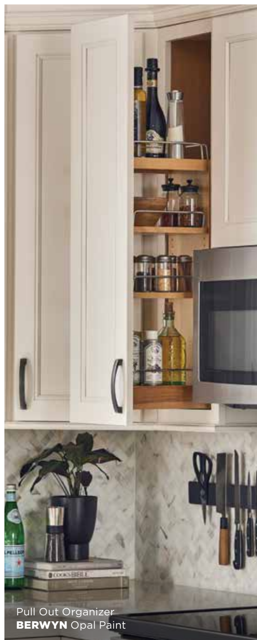
Pull Out Organizer BERWYN Opal Paint