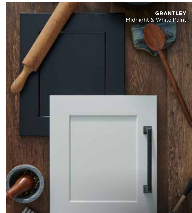
GRANTLEY Midnight & White Paint