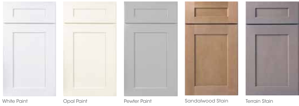
White Paint Opal Paint Pewter Paint Sandalwood Stain Terrain Stain

Featuring a full-overlay, five-piece shaker style with an unmatched finish quality, Grove makes a sophisticated statement in any setting.