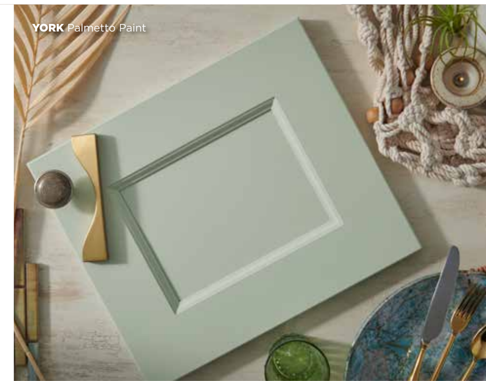
YORK Palmetto Paint