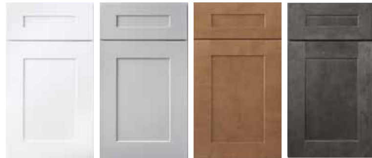
White Paint Pewter Paint Hazelnut Stain Grey Stain