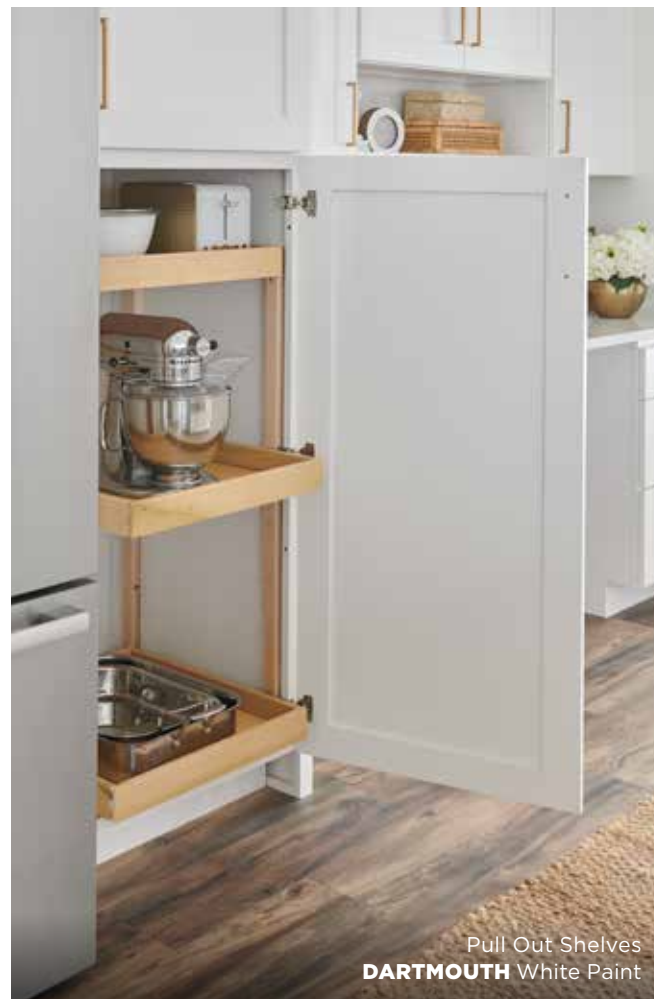
Pull Out Shelves DARTMOUTH White Paint