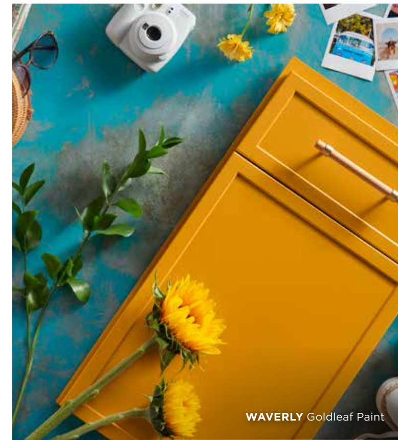
WAVERLY Goldleaf Paint