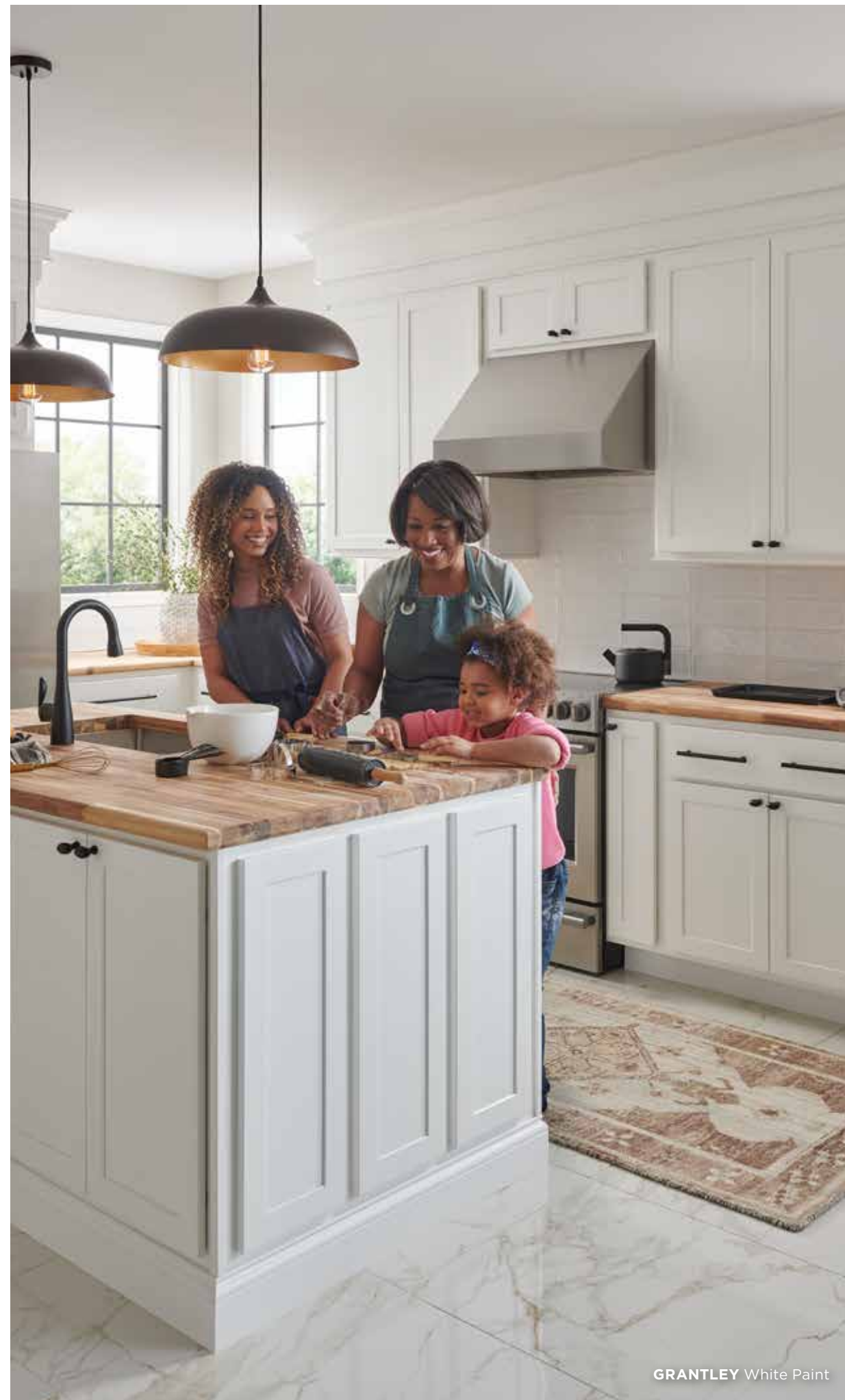
GRANTLEY White Paint