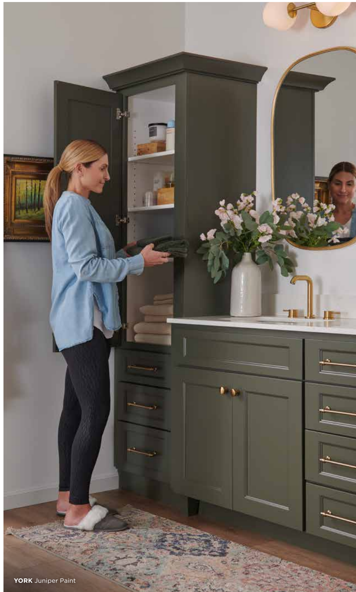
YORK Juniper Paint