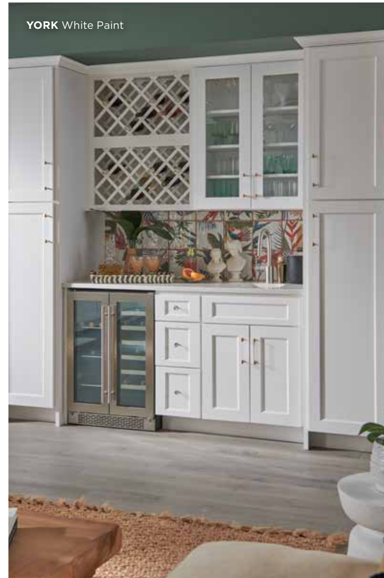
YORK White Paint