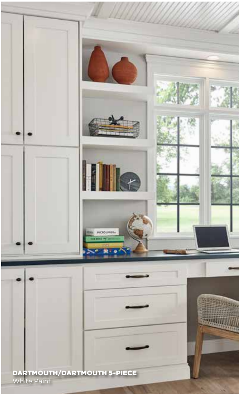
DARTMOUTH/DARTMOUTH 5-PIECE White Paint