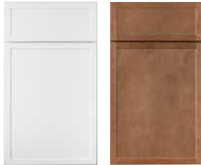
White Paint Hazelnut Stain

A slimmer profile and narrower side stiles give new Waverly cabinets just enough of the shaker tradition, but with a touch of elegance and simplicity that elevates the timeless style. Available in White Paint or Hazelnut Stain.