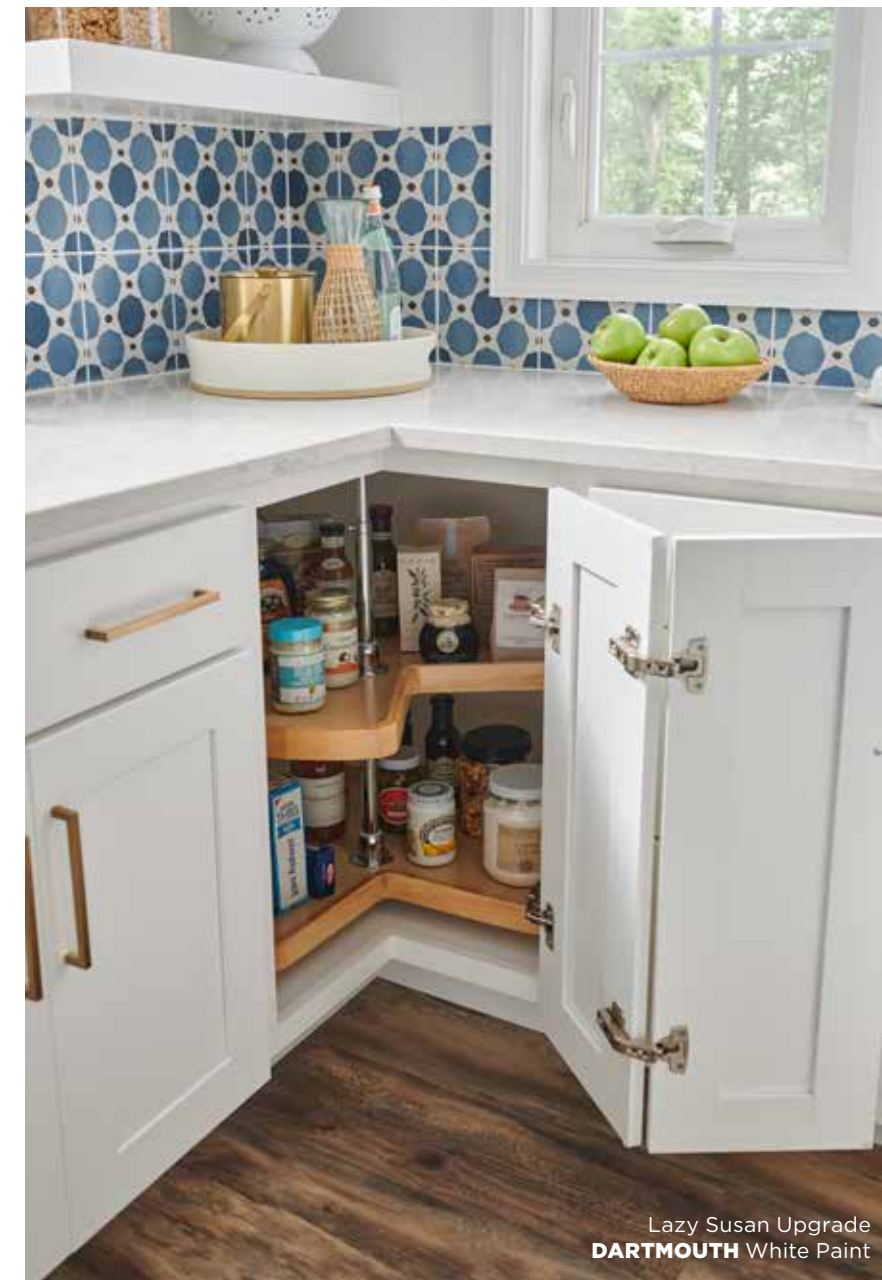
Lazy Susan Upgrade DARTMOUTH White Paint