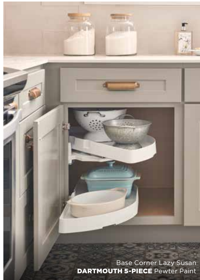
Base Corner Lazy Susan DARTMOUTH 5-PIECE Pewter Paint