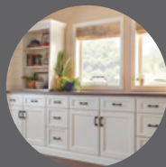
Kitchen & Bath

Find us on Instagram @ wolfhomeproducts for inspiration on your next project!