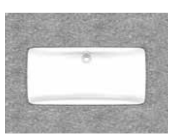
116 Super Wave*